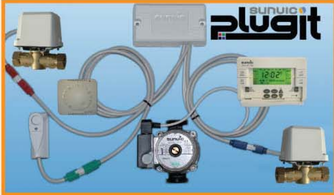
Energy and time saver kit