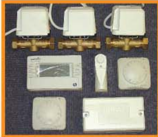
MoMo Univalve 3 Energy Saving Kit

The flexible solution to your heating problems. Sunvic have a superb selection of custom systems available which comply to Building Regulations Part L (Part J Scotland). Your choice of complete control all in one box - simple.