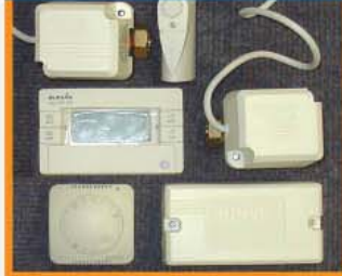
MoMo Univalve Energy Saving Kit