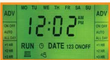
Large clear illuminated display - Real Time Status indication

The Select 207XLS has 7 day, 5/2 day and 24 hour programming options, 'All-in-One' programmer, with two independently time controlled channels e.g. Heating and Hot Water. Designed for use with fully pumped Central Heating Systems, with and option for Gravity systems, using a 3 port mid position motorised valve or two 2 port zone valves.