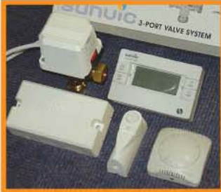
MoMo Unishare Energy Saving Kit