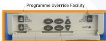
Pull down flap feature - Set Up Programming